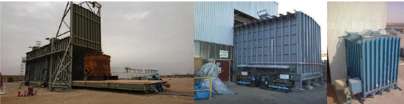
Selection of recent furnace projects

Leading design and construction engineering provider to pharmaceutical, chemical and nuclear industries, UK 66kW Gem Stone cleaning skid comprising of preheat furnace stations and salt cleaning stations. The corrosive cleaning salt has resulted in robust design of the salt pot. This will be incorporated into a comprehensive laboratory spec cleaning procedure resulting in commercially usable gem stones. The system is fully automated and designed to involve little or no human interaction in order to protect against the corrosive nature of the salt.